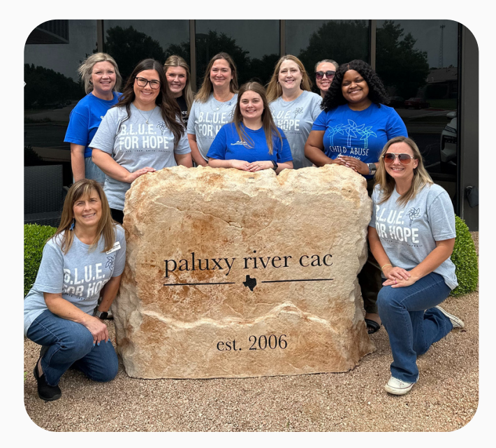
BOULDER DONATED BY: