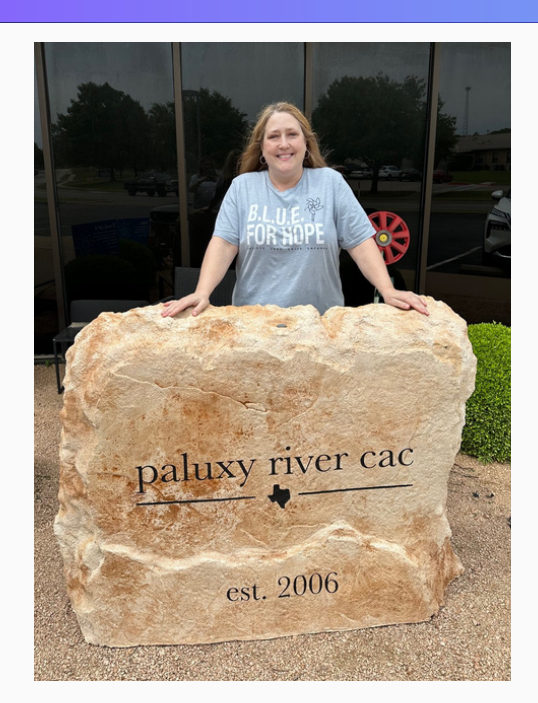
BOULDER DONATED BY: